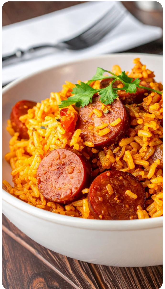
Smoky sausage, tender chicken, and shrimp over perfectly seasoned rice.