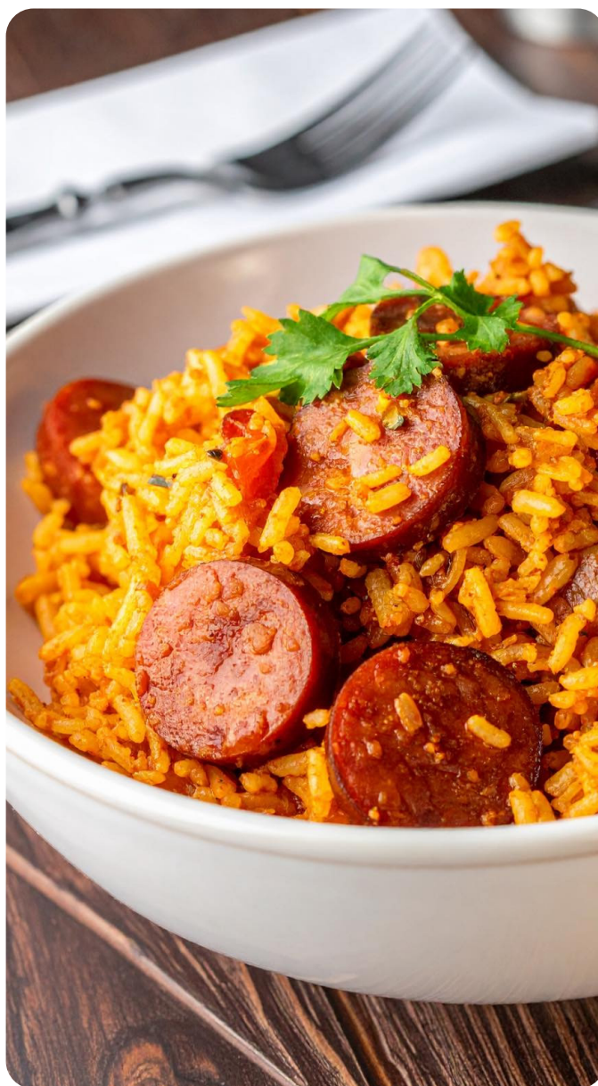
Smoky sausage, tender chicken, and shrimp over perfectly seasoned rice.